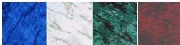
Lt. Blue White Green Ruby

Fundraising for elementary/secondary school foundations.